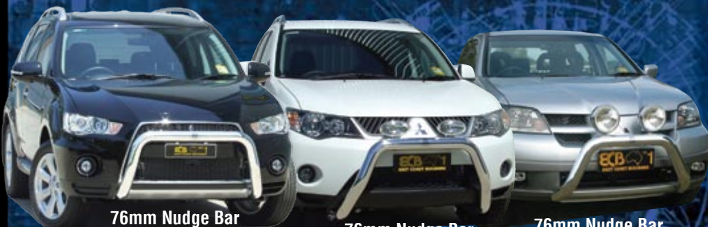
76mm Nudge Bar 10/09 on Models Mirror Polished Alloy

A perfect combination of bumper and grille protection, mixed with sleek, sports styling. The ECB 63mm Series 2 Nudge Bar is a must have for any discerning owner looking to increase frontal protection without compromising style. Manufactured from high tensile, structural grade alloys, this superior quality alloy nudge bar offers superior strength at a much lower weight than steel nudge bars. Designed in Australia, for our harsh Australian conditions, it will never rust or corrode. Standard features of the 63mm Series 2 Nudge Bar include driving light mounting points and the ECB lifetime Guarantee, for total peace of mind.