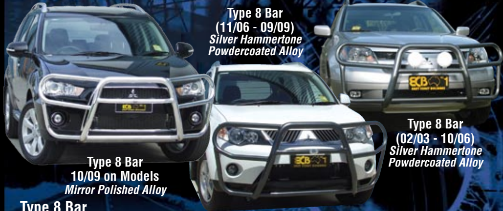
Type 8 Bar (11/06 - 09/09) Silver Hammertone Powdercoated Alloy

Not only do ECB protection bars meet Australian design rules, each one is also covered by ECB's exclusive lifetime warranty for complete peace of mind.