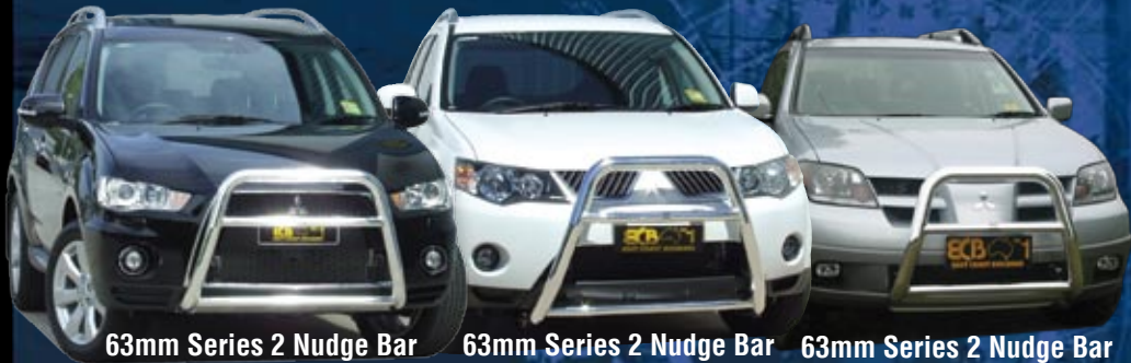
63mm Series 2 Nudge Bar 10/09 on Models Mirror Polished Alloy

Ensure your vehicle and it's passengers are protected in any environment or situation, install the best in Outlander frontal protection, the ECB Type 8 Bar specifically engineered for the Mitsubishi Outlander. Manufactured from high tensile, structural grade alloys the Type 8 offers incredible strength and full frontal protection, while keeping weight to an absolute minimum. This Type 8 bar has been specifically engineered for the Mitsubishi Outlander to ensure the bar fits tightly and perfectly complements the aggressive styling of the front-end. Standard inclusions of the Type 8 Bar include spotlight mounting provisions, the ECB lifetime warranty and your choice of powdercoated alloy or mirror polished alloy finishes. All ECB products are ADR compliant and air bag compatible.